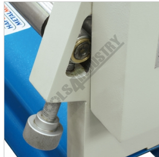
Adjustable Rear Curving Roller