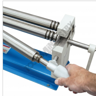
Swivel Top Roller