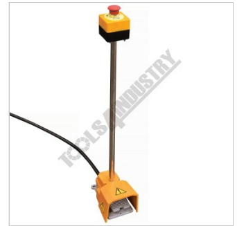
Mobile foot pedal