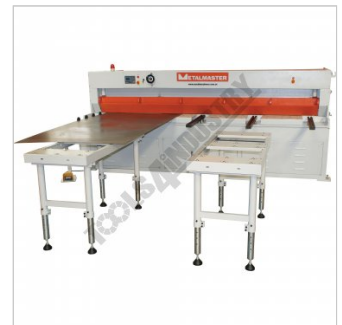
Optional ball transfer table extensions - Shown with different machine