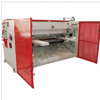
Rear guarding with safety sensors