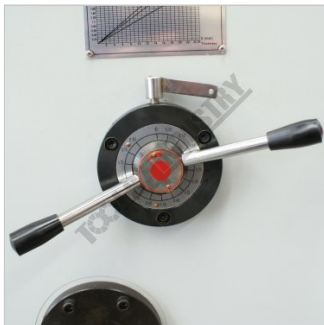
Rapid blade clearance adjustment