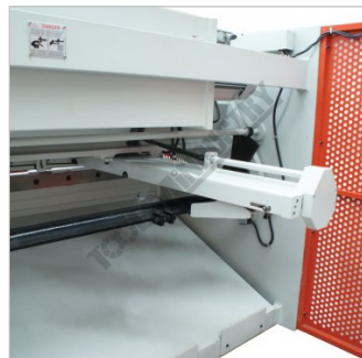
1000mm Powered ballscrew back gauge