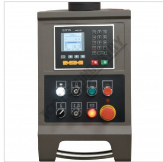
Pendant control unit