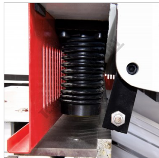
Hydraulic material hold downs