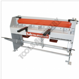
Right Top View