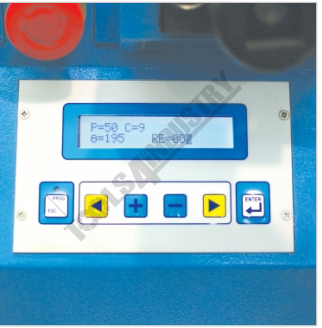
Programmable Control Panel