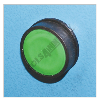
Deadman's Safety Buttons-Left & Right