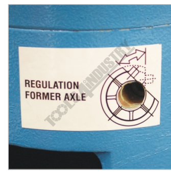
Regulation Former Axle