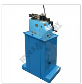
Shown with optional stand