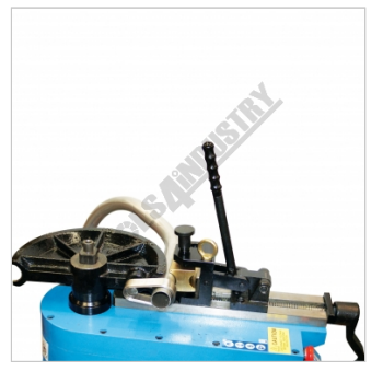
Optional Tube Former with Brass Counter Former