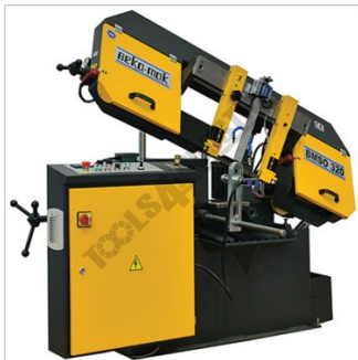
Front Left View