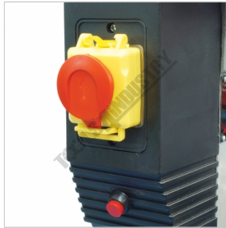
Emergency Stop Switch and Light Switch