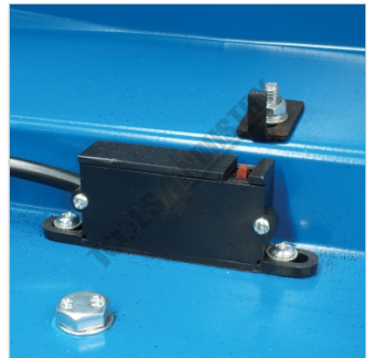
Safety Micro Switch on Pulley Guard