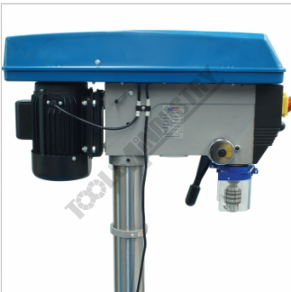
Head Side View