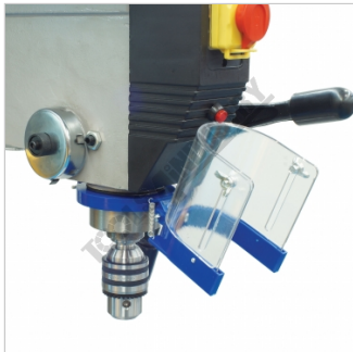
Safety Chuck Guard Flipped Up