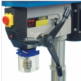
1 Piece Cast Iron Drilling Lever