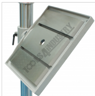
Tilting and Rotating Cast Iron Table