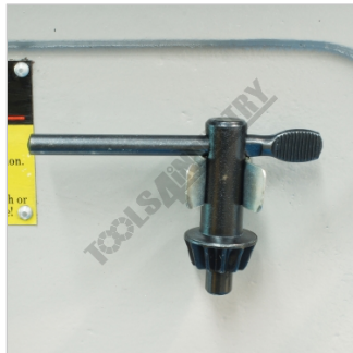
Chuck Key Holder