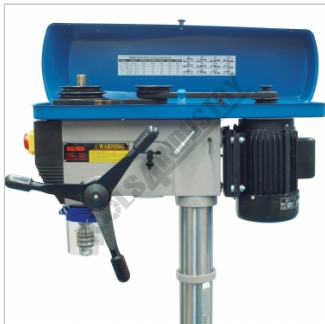
A Section Belt Drive System