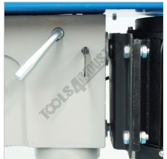
Belt Tension Lever and Lock