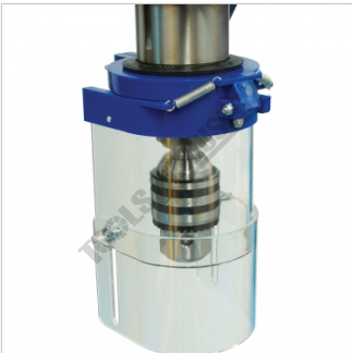
Adjustable Safety Chuck Guard with Flip Up Screen