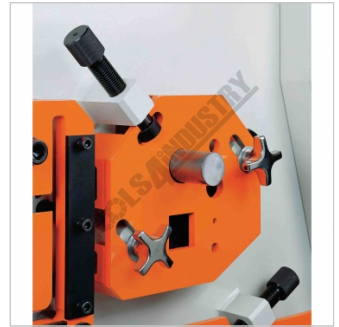
Round Bar Shear