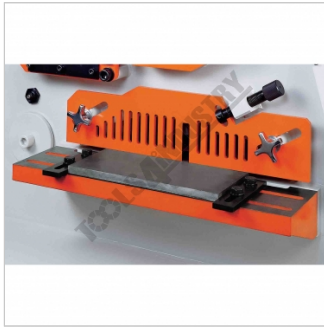
Flat Bar Shear