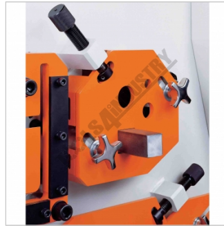
Square Bar Shear