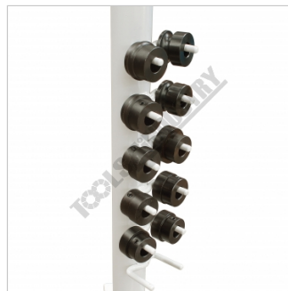
Rolls Stored on Stand