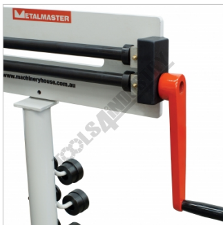
Gear Driven Rollers