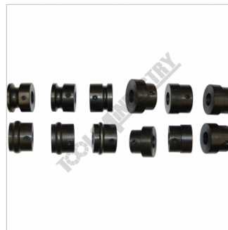
6 x Sets of Rolls Included