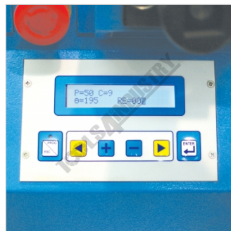
Programmable Control Panel