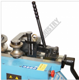
Quick Action Clamp