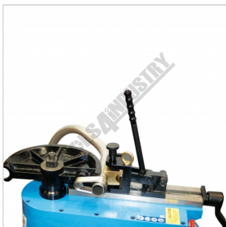
Optional Tube Former with Brass Counter Former