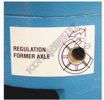
Regulation Former Axle