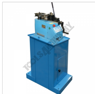
Shown with optional stand