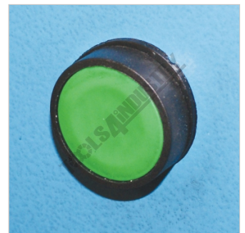
Deadman's Safety Buttons- Left & Right