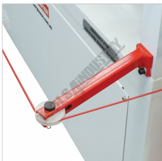
Safety Wire Interlock System