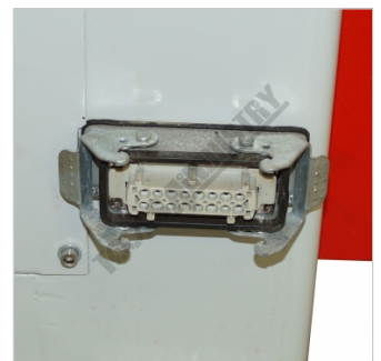
Foot Control Connection Point