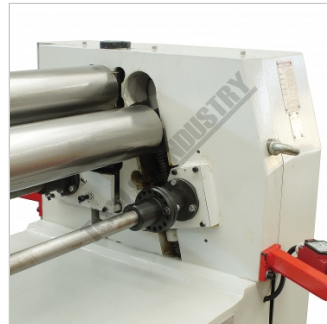
Motorised Up and Down Rear Curving Roller Right Side