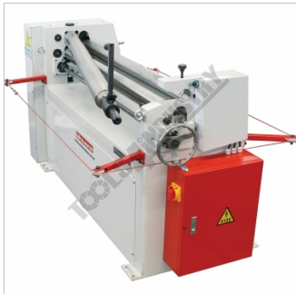
Swing Out Top Roller