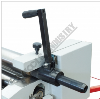
Swing Out Top Roller Handle