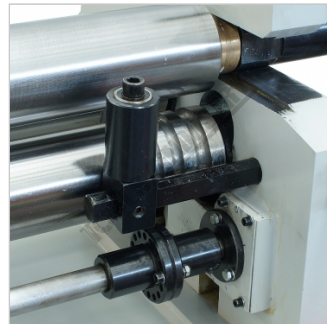
Conical Bending Guide Roller