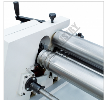
Wire Groove Rolls