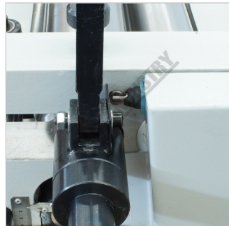
Top Swing Out Roller Micro Switch