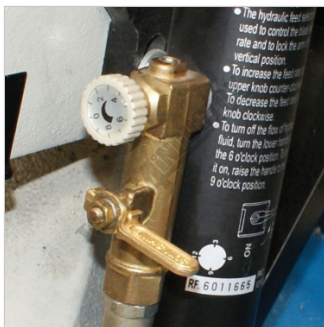
Down Feed Control