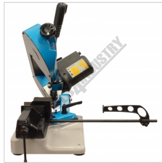
Shown at Zero degrees