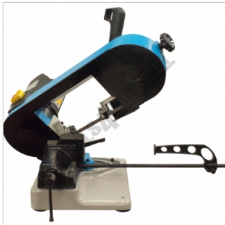
Shown at 60 degrees