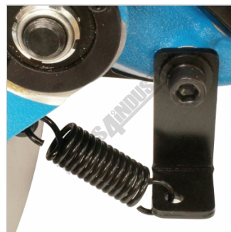
Spring Return Cutting Head