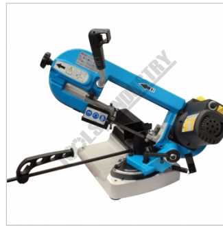
Swivel Head 60 degrees