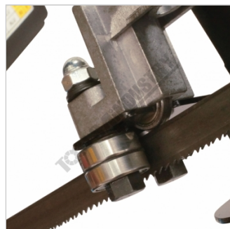
Ball Bearing Blade Guides