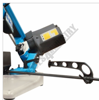
Material Length Stop