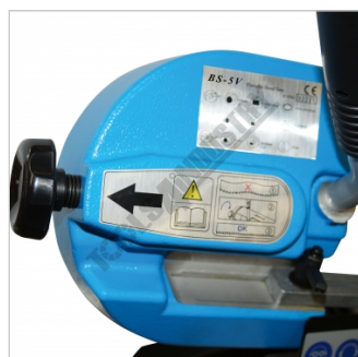
Blade Tension Adjustment