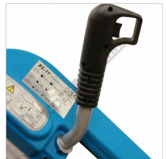
Blade Trigger On/Off Switch