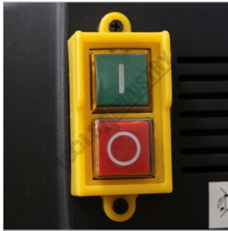
Main Power Switch