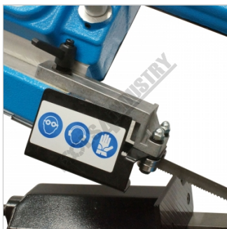
Blade Guide Adjustment