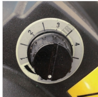
Variable Speed Dial