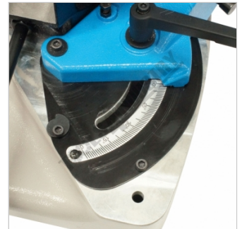
Cutting Angle Adjustment