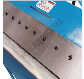
Removable Fingers for Bending Pans or Boxes