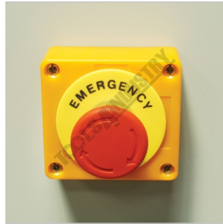
Emergency Stop Switch