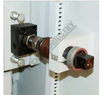
Quick Action Blade Clearance Adjustment