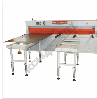
Shown with Optional Ball Transfer Tables