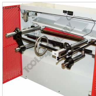
Manual Backgauge with Digital Readout