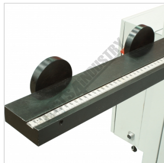
Squaring Arm with Measuring Scale