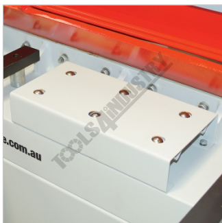
Material Transfer Balls on Table