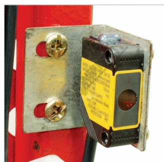
Safety Omron E32S Rear Light Sensor Guarding