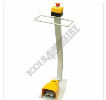
Mobile Foot Control