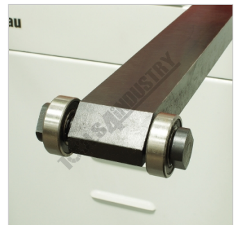
Front Sheet Supports with Roller Bearings