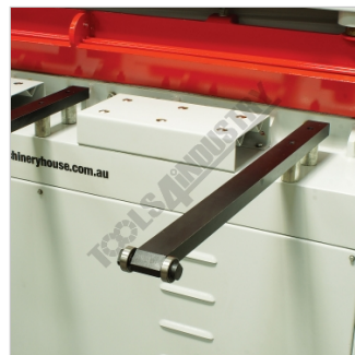
Front Sheet Supports