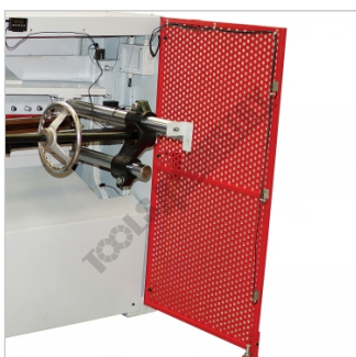
3 Safety Electro Photo Sensors