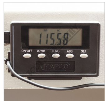
Backgauge Digital Readout