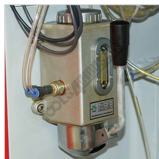
One Shot Lubrication