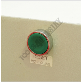
Rear Guard Reset Button