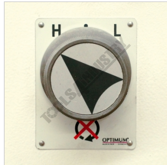
High Low Geared Drive