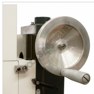
Z-Axis Hand Wheel