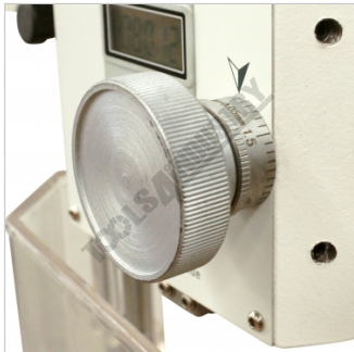
Quill Fine Adjustment