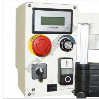
Variable Spindle Speed & Spindle DRO