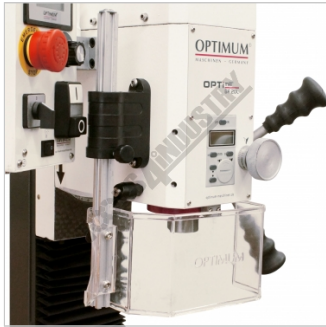
Safety Cutter Guard