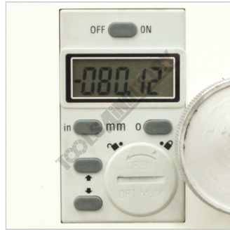
Quill Depth Digital Readout