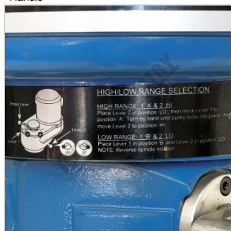
High Low Speed Selection