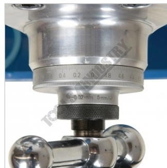
X Axis Dial Other Side