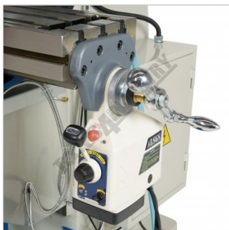
X Axis Power Feed with Rapid