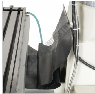
Slide Way Cover