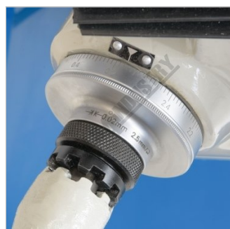
Z Axis Dial