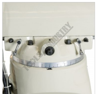
Adjustable Swivel and Sliding Ram