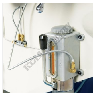
One Shot Lubrication System