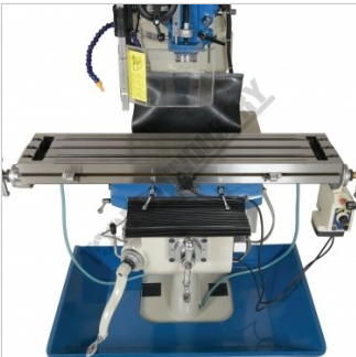
Hardened and Ground Work Table