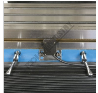
Table Feed Limit Switch