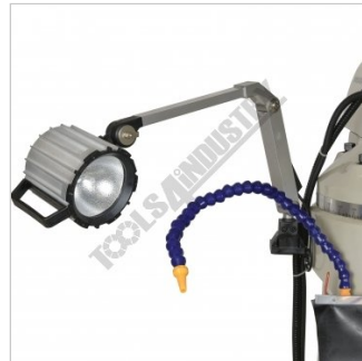
Work Light and Coolant Hose