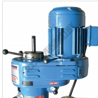
Heavy Duty 3hp 240V Motor