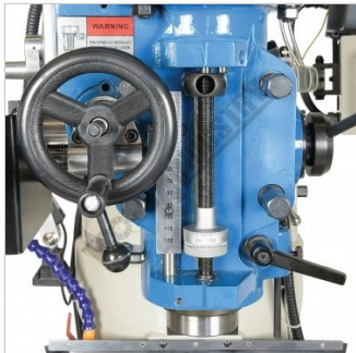
Quill Feed Depth Stop