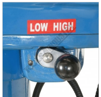
Low High Speed Lever