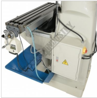
X & Y Axis Scales