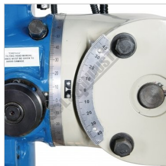
Tilting and Rotating Head Scales