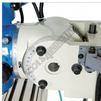
Tilting and Rotating Head