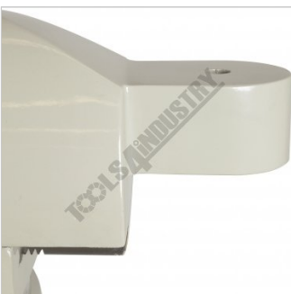
Tail Lug Supports Optional Slotting Head