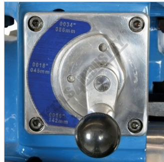
Feed Selection Handle