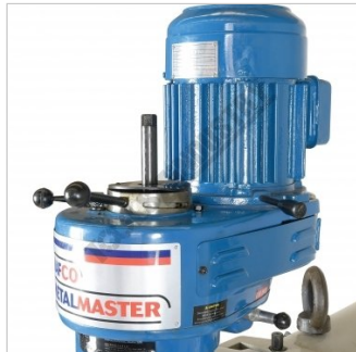
Spindle Break Lever High or Low Speed Selector and Belt Tension Handle