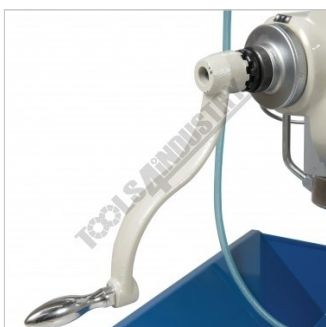
Z Axis Handle