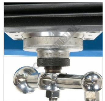
Y Axis Dial