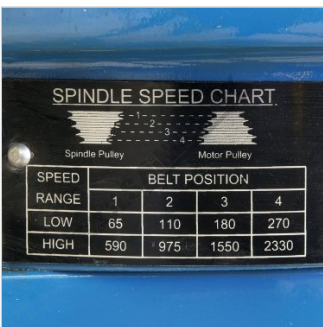
Spindle Speed Chart