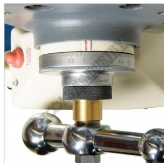
X Axis Dial