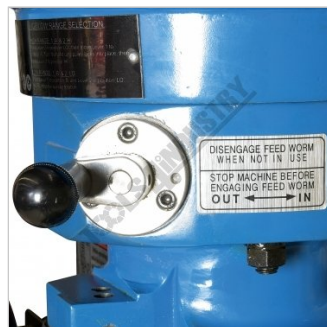
Quill Feed Lever