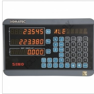
3 Axis DRO with X & Y Axis Scales