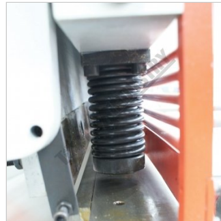
Hydraulic material hold downs