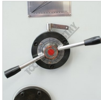
Blade clearance adjustment lever