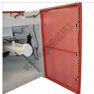
3 x Photo electric rear guarding