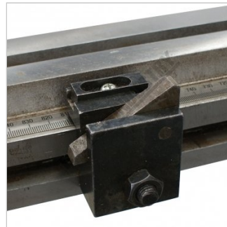
Flip over material stop