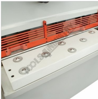
Material transfer balls on the table