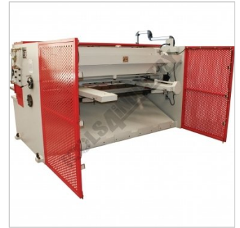
Rear guarding view