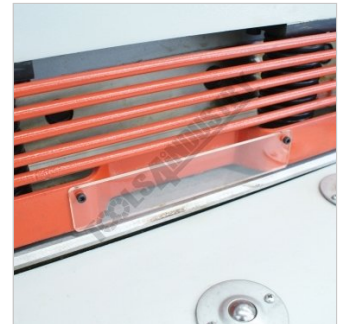
Hi visibility finger safety guard