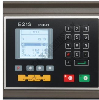
Estun E21S controller