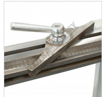
Adjustable and sliding mitre guide