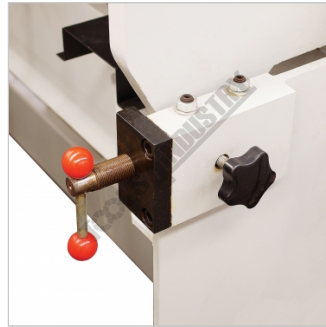
Quick Head Adjustment for Material Thickness