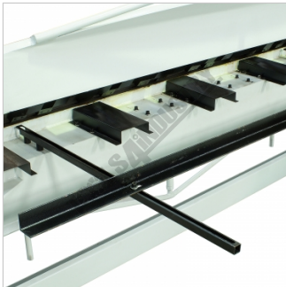
Rear Manual Backgauge