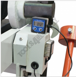
Digital Angle Readout