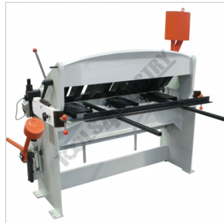
Rear Back Gauge