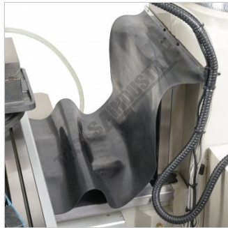
Rear Slideway Protection Cover