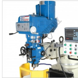
Head Close Up