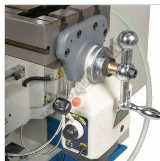
X Axis Power Feed with Rapid