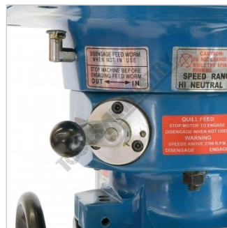
Quill Feed Engage Lever