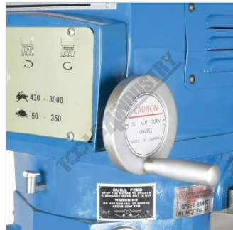
Variable Speed Hand Wheel