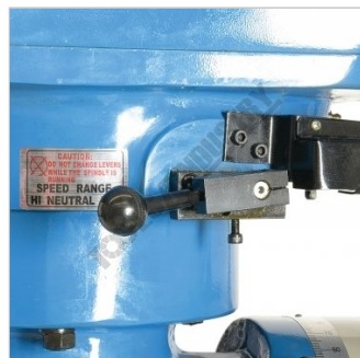
High Low Speed Range Selection Lever