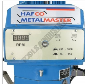
Variable Speed Digital Display