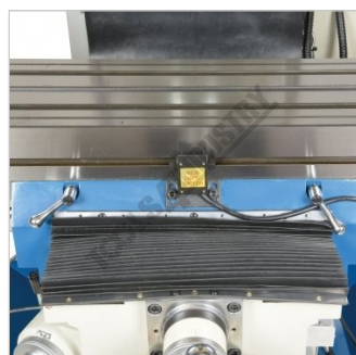
Table Feed Limit Switches