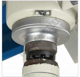
Z Axis Dial Graduations