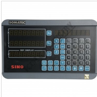
3 Axis Digital Readout