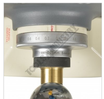
X Axis Dial Graduations