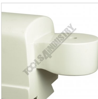
Tail Lug Spigot Supports Slotting Head