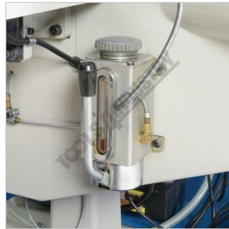
Manual Slideway Lubrication Pump