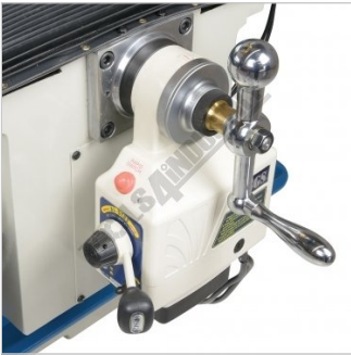
Y Axis Power Feed with Rapid