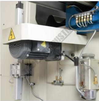
Z Axis Elevating Motor