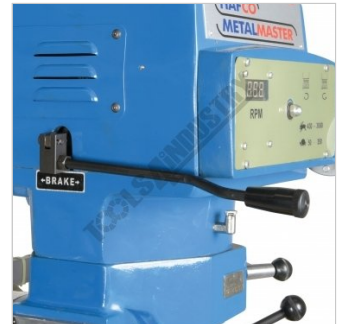
Spindle Brake Lever