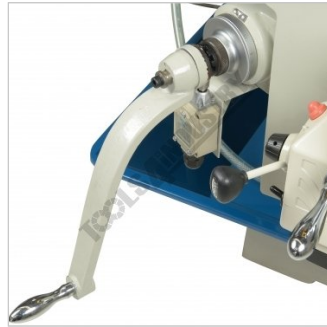
Z Axis Handle