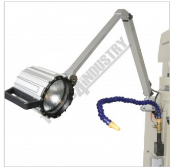
Work Light and Coolant Hose