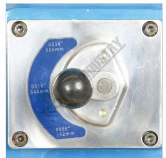
Feed Speed Selector Lever