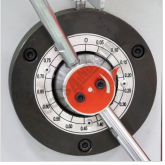
Blade Clearance Adjustment Lever