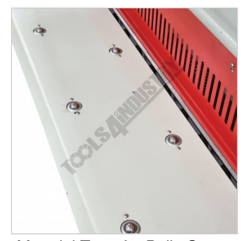
Material Transfer Balls On The Table