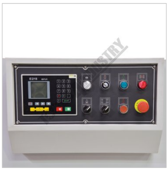
Estun E21S Control