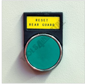
Rear Guard Rest Button