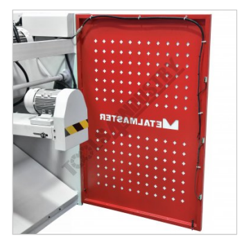
3 X Laser Light Sensor Guarding System