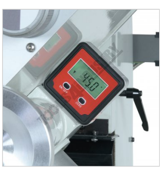
Digital Tilting Head Gauge