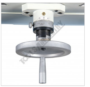
Table Cross Feed Dial