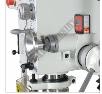
Fine Feed Handwheel