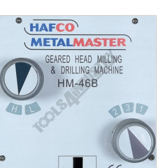
Spindle Speed Selectors