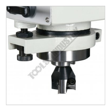
Includes Face Mill Cutter