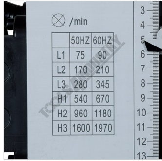
Spindle Speed Chart