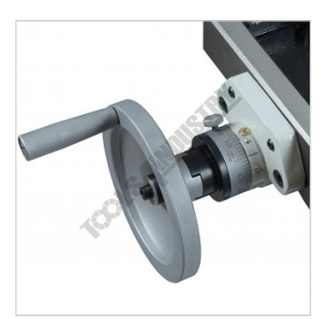
Table Longitudinal Dial