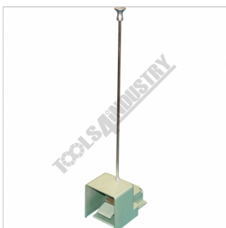
Roving Foot Pedal