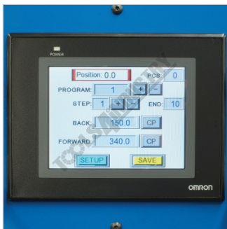
Touch Screen NC Control