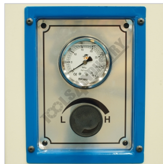
Pressure Adjustment Dial and Gauge