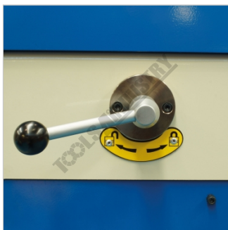
Main Post Release Lock Lever