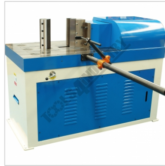
Rear View with Backgauge