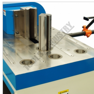
Table with Posts Removed for Optional Attachments