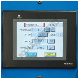
Touch Screen NC Control