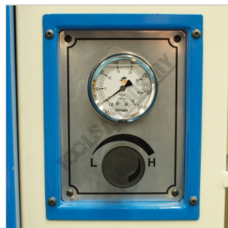
Pressure Adjustment Dial and Gauge