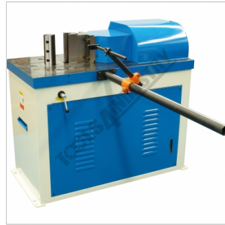
Rear View with Backgauge