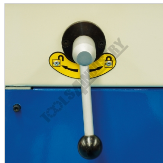
Main Post Release Lock Lever