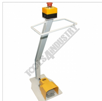
Roving Foot Pedal