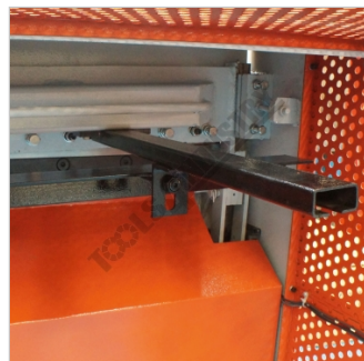
Rear Back Gauge