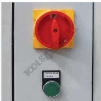
Isolation Switch & Rear Guard Reset Button