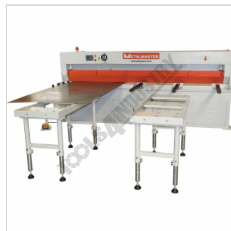
Shown with Optional Ball Transfer Tables