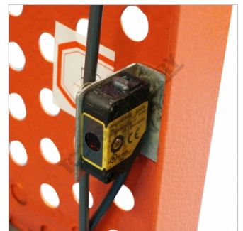
Electric Safety Sensor